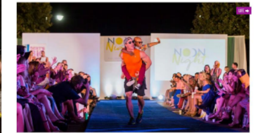
The annual 'Noon to Night' celebrity fashion show benefiting Bert's Big Adventure will be held from 6 p.m. to 10 p.m. Sept. 14 at Avalon in Alpharetta.