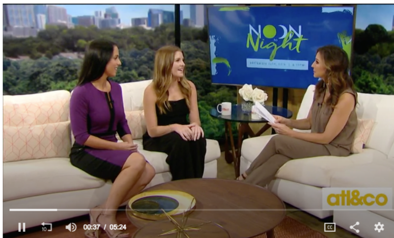
Noon to Night at Avalon! Join us at this fashion benefit Thursday night, benefiting Bert's Big Adventure

Published: 2:13 PM EDT September 11, 2018 Updated: 10:13 AM EDT September 11, 2018